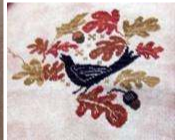
It's so late this afternoon that the rest will have to wait till next time. Here are some photos taken in and out of the shop during the past several weeks.