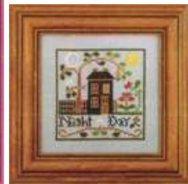
November and December releases from Country Cottage Needleworks with "Bluebell" ($12) and "Cottage Garden" threadpacks finishing off the series of six.