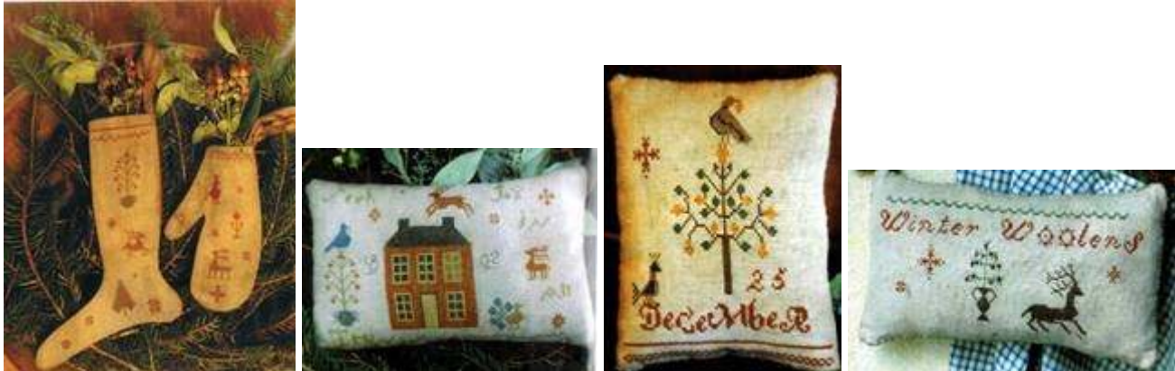
From Notforgotten Farms , "Jingle All the Way" ($8) and "Parson Brown" ($8)