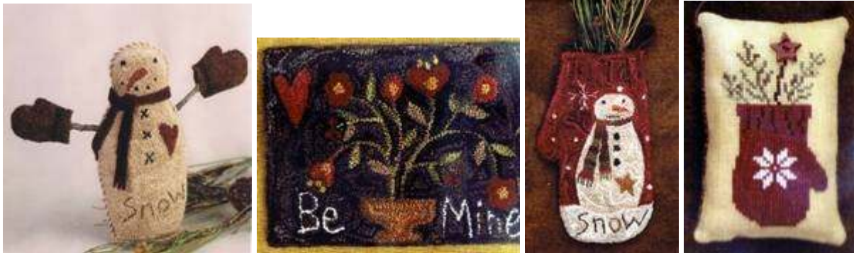
We still have the Stone & Thread trunk show through the weekend, so if you've not seen their models, be sure and stop in tomorrow. Here are just a few of them.