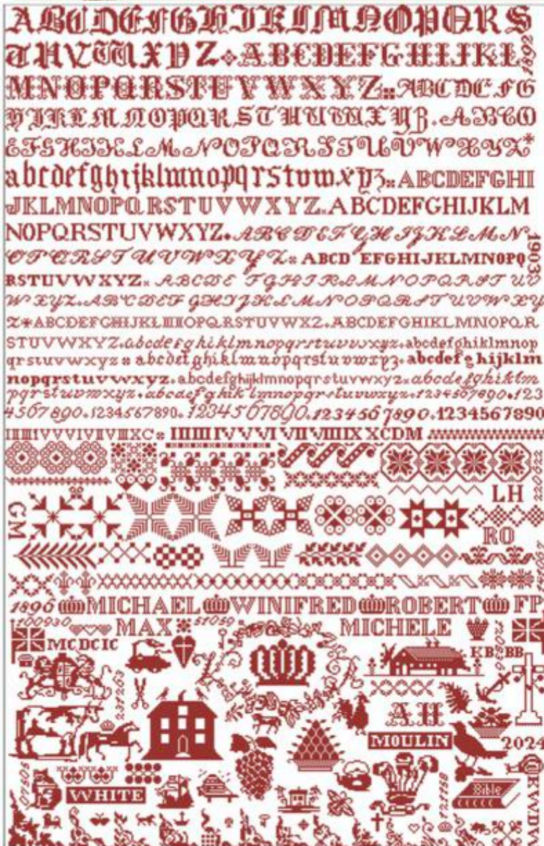
A FAMILY RECORD - A BRISTOL ORPHANAGE TRIBUTE SAMPLER, 350 x 544