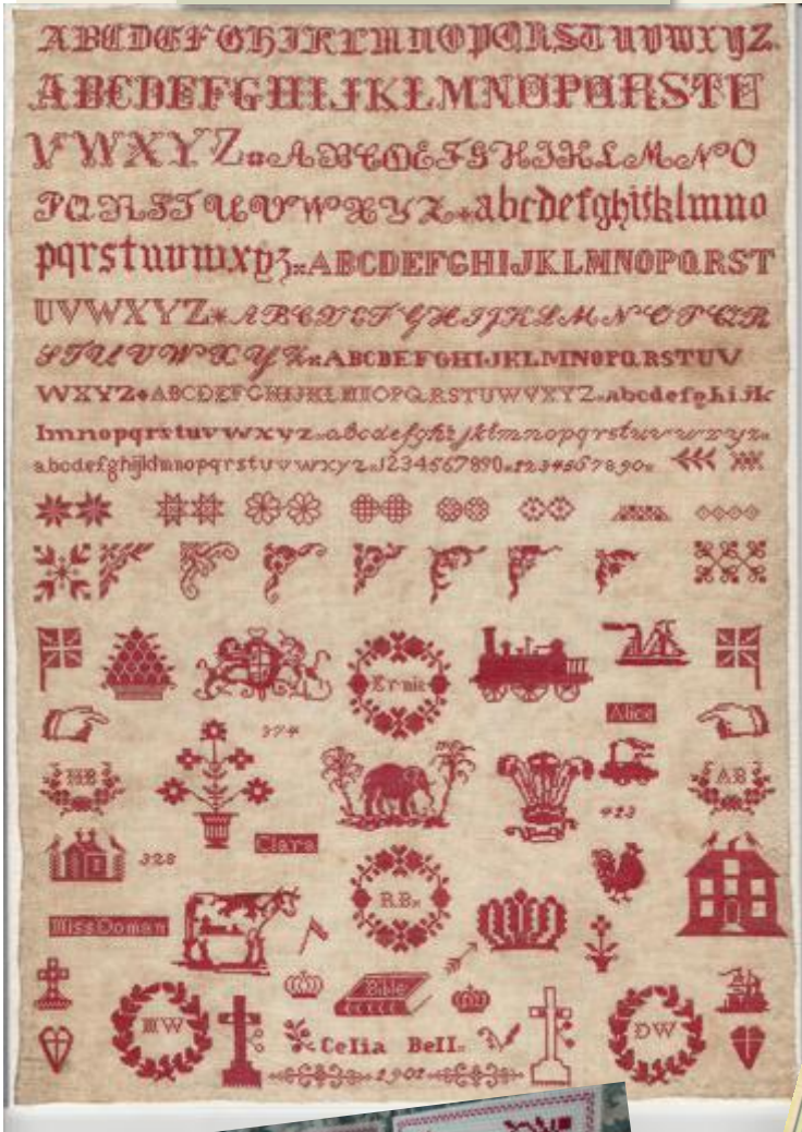
CELIA BELL SAMPLER, 340 x 382