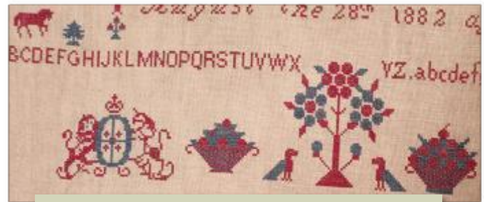
NELLIE OSBOURNE 1882, 363 x 280

Below are snippets from the reproduction of Nellie's sampler, stitched on 46ct Superstition Shadows , an exclusive Attic color being introduced by Tabbycat Linens, with 2 glorious silks in Soie 100.3.